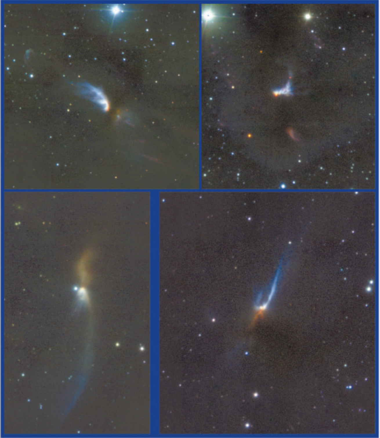
Fig. 2. VLT/UT1–ISAAC JHK observations of four young stellar objects in the Gum Nebula. The objects are HH 46/47 (upper left), CG 30 (upper right), Re 4 (lower left), and Re 5 (lower right). North is up and east left for HH 46/47, CG 30, and Re 4; Re 5 has north right and east up. The field sizes are (in arcsec): 143 \times 123 , 121 \times 130 , 86 \times 143 , 125 \times 140 , respectively.